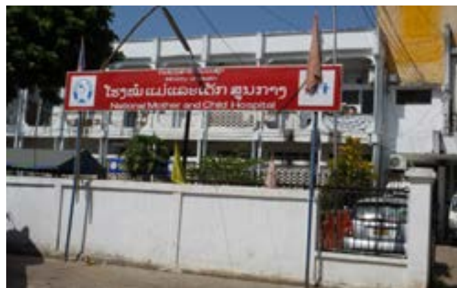
Photo: 2 health professionals from 9 hospitals attending the sign language training