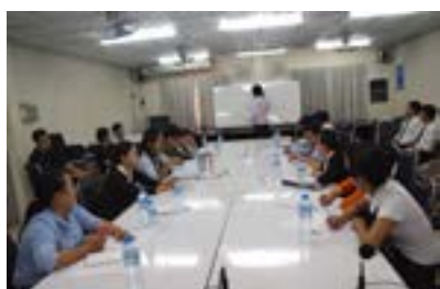
Photo: Session of Disability Rights and Equality Training

- Conducting DRET and Media training to Journalists in the Vientiane Capital, Vientiane Province, Savanakheth Province and Champasack Province.