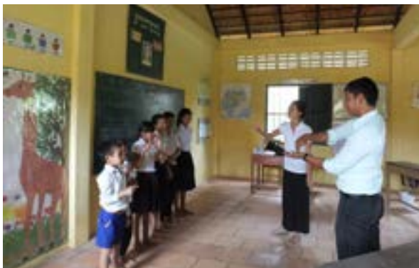
Photo: A class room at the Krousar Thmey school