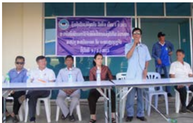
Photo: Advocacy campaign by the Lao Association of the Blind