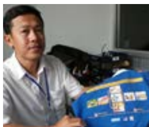
Photo: IEC material used in training by Handicap International Cambodia