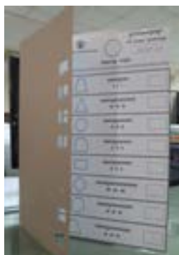
Photo: Sample ballot template used by persons with visual impairment in the election

- Organizing a national workshop to share good practices on access to election information and raise awareness among relevant stakeholders (TV, Journalists, NGOs, Donors, DPOs).