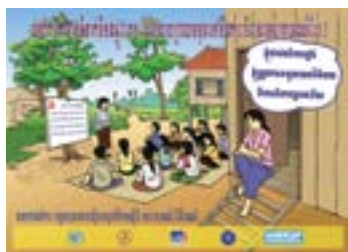
Photo: “ Access to Local Awareness Raising” produced by Handicap International Cambodia